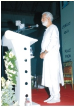
Guruji channelling Light along with the audience.