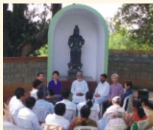
Our students from Japan participated in this month's iGuruji session.

Gift a Subscription to a friend. Send us the name and address, along with the Subscription amount.