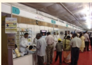
Our stall at the Bangalore Book Festival 2008 was designed and managed by our own volunteers.

Gift a Subscription to a friend. Send us the name and address, along with the Subscription amount.