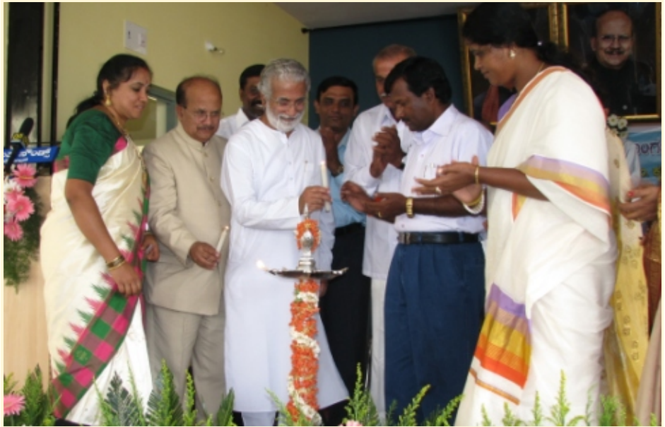
Guruji lighting the lamp to inaugurate the Auditorium at Anekal.

Gift a Subscription to a friend. Send us the name and address, along with the Subscription amount.