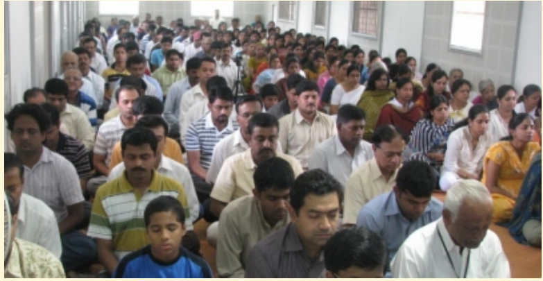
More than 350 people had gathered on the occasion of Amara Maha Samadhi day on 30-8-2009.

Gift a Subscription to a friend. Send us the name and address, along with the Subscription amount.