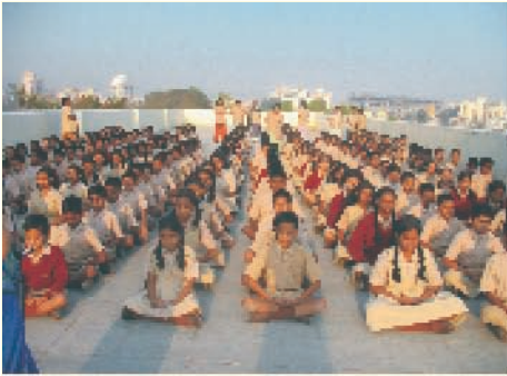
Kalmadi High School, Aundh, Pune