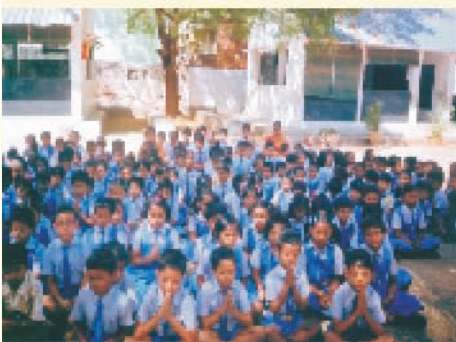
CKT Primary School Kovilpatti, Tamilnadu