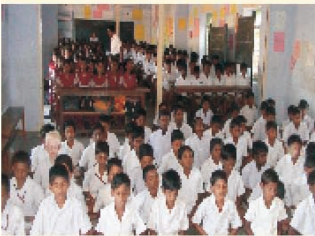
SMRV High School, Nagercoil