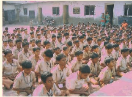
Prithviraj Hindi High school, Nalpada