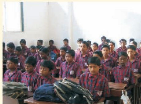
Shivaji Vidyalaya, Shivaji Nagar, Thane