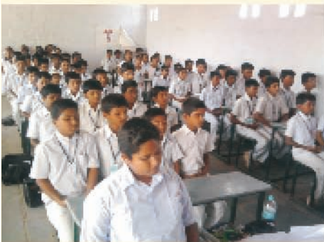
Rayalaseema School, Madanapalle