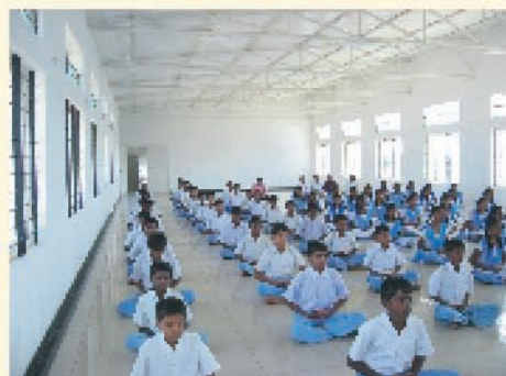
Vikas Vidyakendra, Ramamurthy Nagar, Bangalore