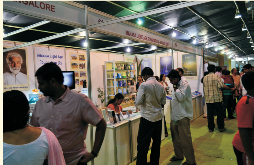
November 2011 - Our stall at Bangalore Book Festival

Gift a Subscription to a friend. Send us the name and address, along with the Subscription amount.