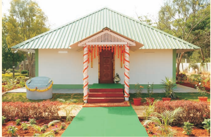
The Pyramid shaped Prayer Hall built in Tapovana where Guruji was cremated

Gift a Subscription to a friend. Send us the name and address, along with the Subscription amount.