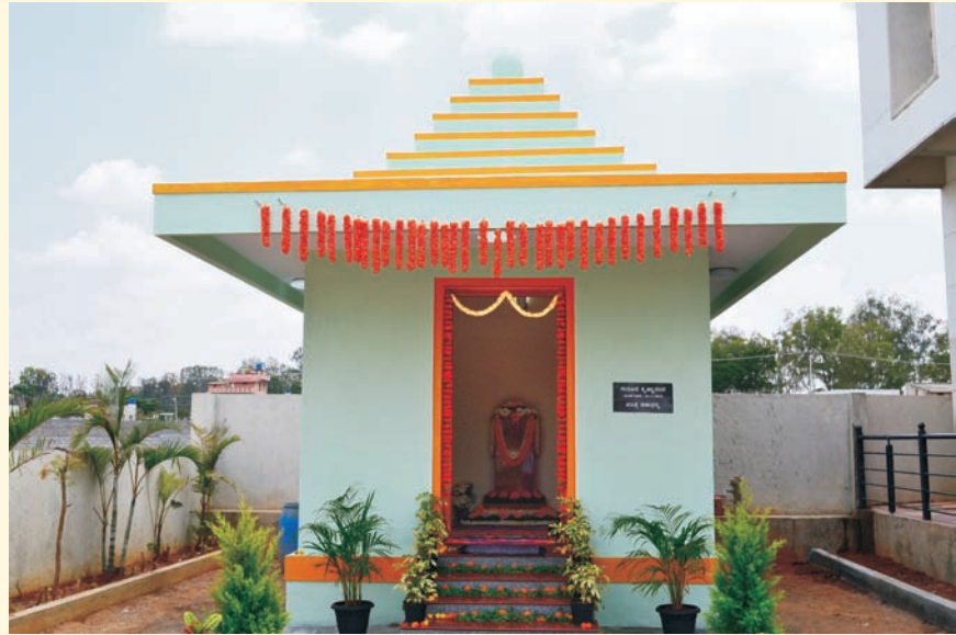
On 15th April, Guruji's Holy Ashes were installed at the Anekal Centre in a newly built structure

Gift a Subscription to a friend. Send us the name and address, along with the Subscription amount.