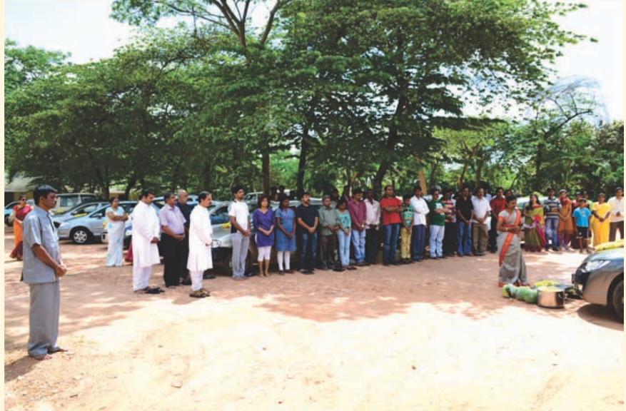
On the occasion of Ayudha Puja, the residents of Taponagara energising their vehicles by filling them with Divine Light.

Gift a Subscription to a friend. Send us the name and address, along with the Subscription amount.