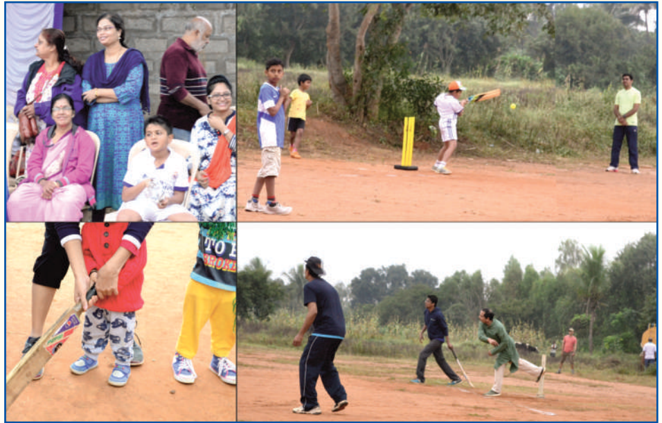
Residents played cricket matches in Taponagara.