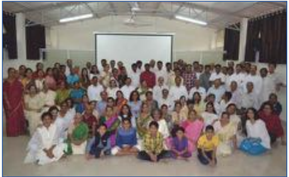
The success of World Channels Day 2019 was celebrated by Light Channels Volunteers.

Gift a Subscription to a friend. Send us the name and address, along with the Subscription amount.