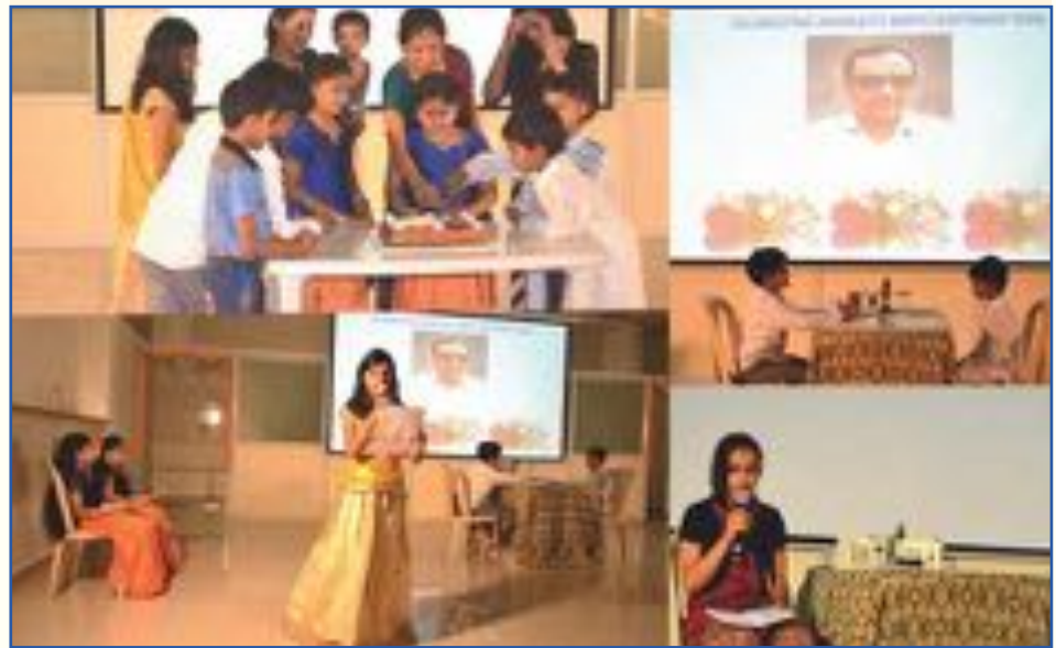
Residents' Meet at Taponagara.

Gift a Subscription to a friend. Send us the name and address, along with the Subscription amount.