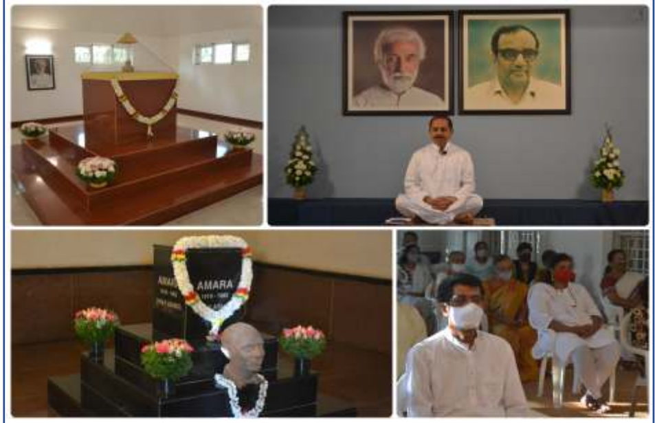
Live Light Channelling sessions were conducted at Taponagara on 1st February, the 11th World Channels Day.

Gift a Subscription to a friend. Send us the name and address, along with the Subscription amount.